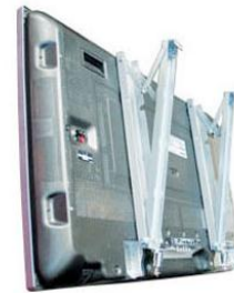
Wall Mounted Tilt