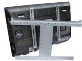
Wall Mounted Fixed

The Axis by Gilkon Plasma Tilt Adjustable Wall Mount adjusts up to 15 degrees. Suitable for most plasma screen up to 65". Fixed version also available.