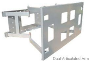
Dual Articulated Arm