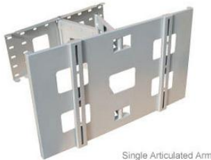
Single Articulated Arm