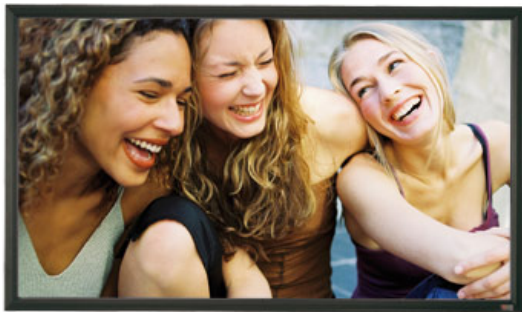
Flocked Frame Screens