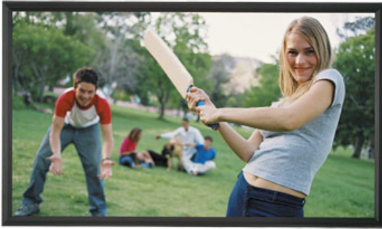
Powdercoated Fixed Frame Screen

Ideal for a home theatre or boardroom needing a screen that's always ready.