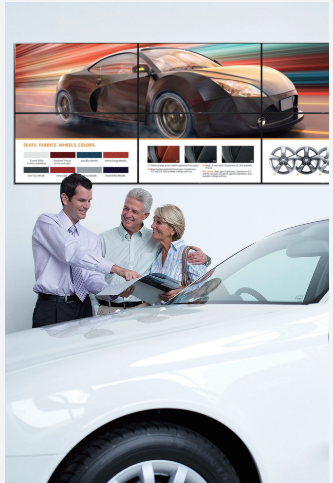
Figure 2. Improved video wall color calibration for color uniformity

The integrated factory color tuning process has been refined for white balancing and color difference compensation, resulting in improved color temperature matching. The Samsung Color Expert software with built-in ACM chipset is also enhanced for ease of use and performance and offers three options: gamma calibration, local uniformity and white balance. The calibration speed is higher and the user interface (UI) is augmented for more precise color management. Light reflection, absorption and scatter are significantly reduced with the help of the Ultra Clear Panel. As a result of Ultra Clear Panel technology, images are brighter and sharper, which ultimately improves content visibility.