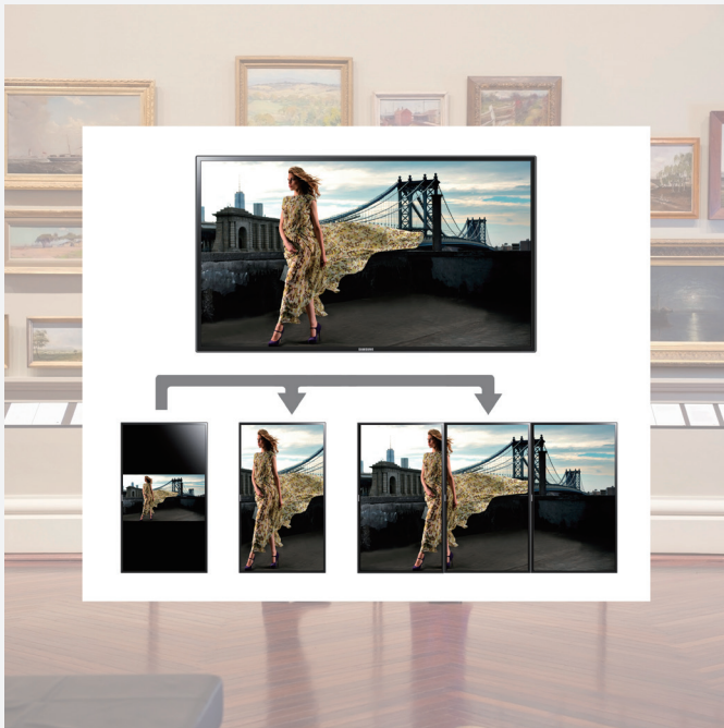
Figure 3. Portrait to landscape image rotation enhances usability with no loss of resolution

UED Series displays offer pivoting capability and image rotation software that can change image orientation from portrait to landscape for greater display flexibility. For convenience when rotating images, two ratio options are available: original ratio or auto full-sizing ratio. Users do not need to rotate a picture in the software to make it appear correctly in a different orientation.