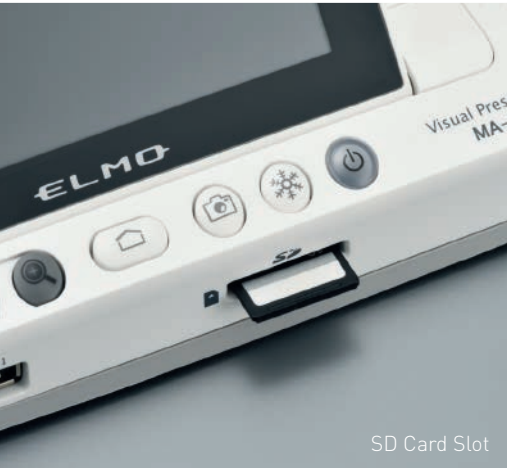
SD Card Slot