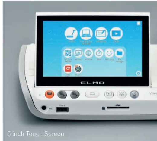
5 inch Touch Screen